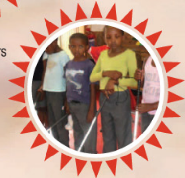
Sibonile School (Egoli Blind)