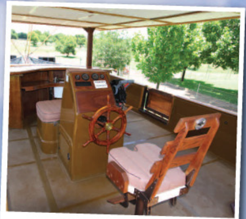
A custom-built boat, Novacraft