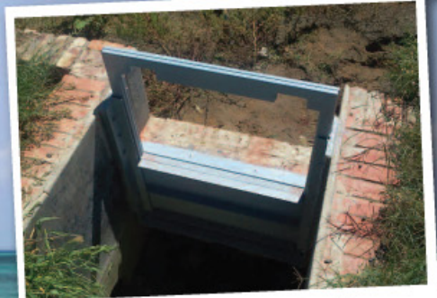
A stop gate produced by Formo Fibreglass, using Scott Bader resin

Scott Bader is proud of our innovative products, superior service and strong client relationships. We work hard to ensure that we deliver the best quality to our clients in all that we do and we are always pleased to receive their positive feedback. Here are a few comments from our clients: