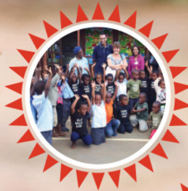
1000 Hills Community helpers