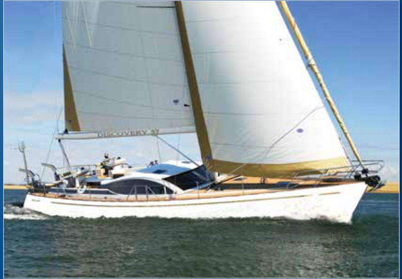
Discovery 57 yacht, manufactured using Crystic Permabright gelcoat

// Nigel Stuart, M.D. – Discovery Yachts