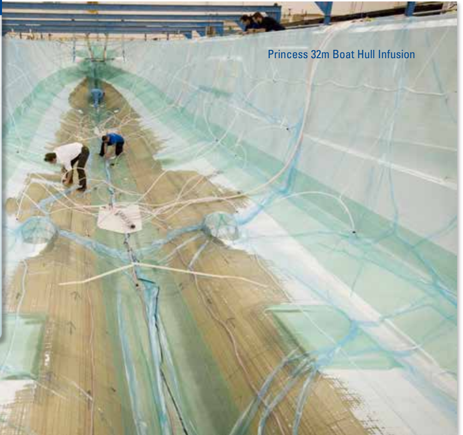
Princess 32m Boat Hull Infusion