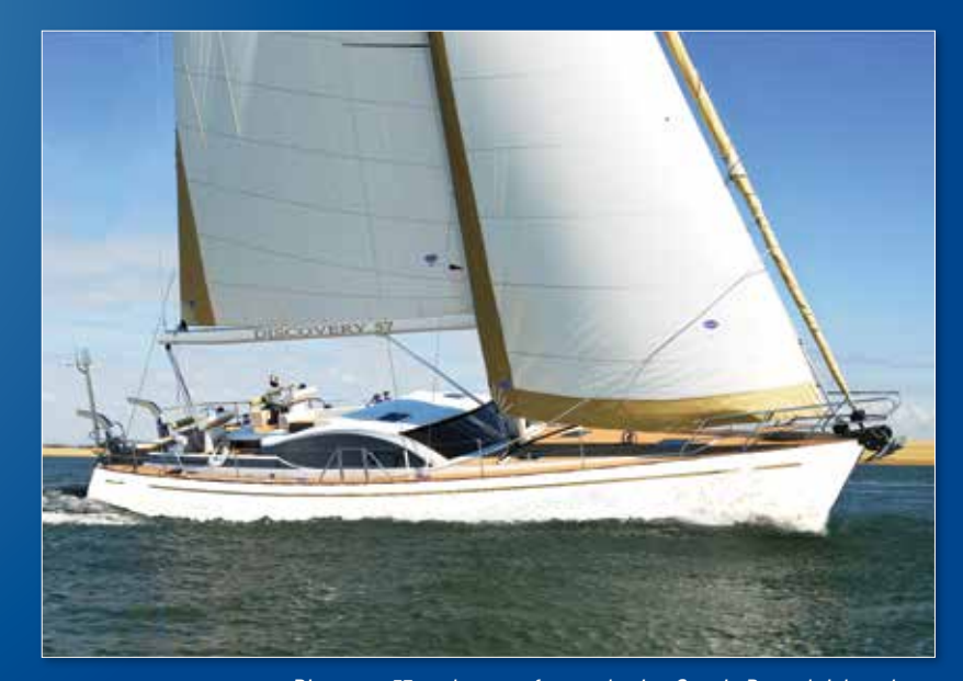
Discovery 57 yacht, manufactured using Crystic Permabright gelcoat